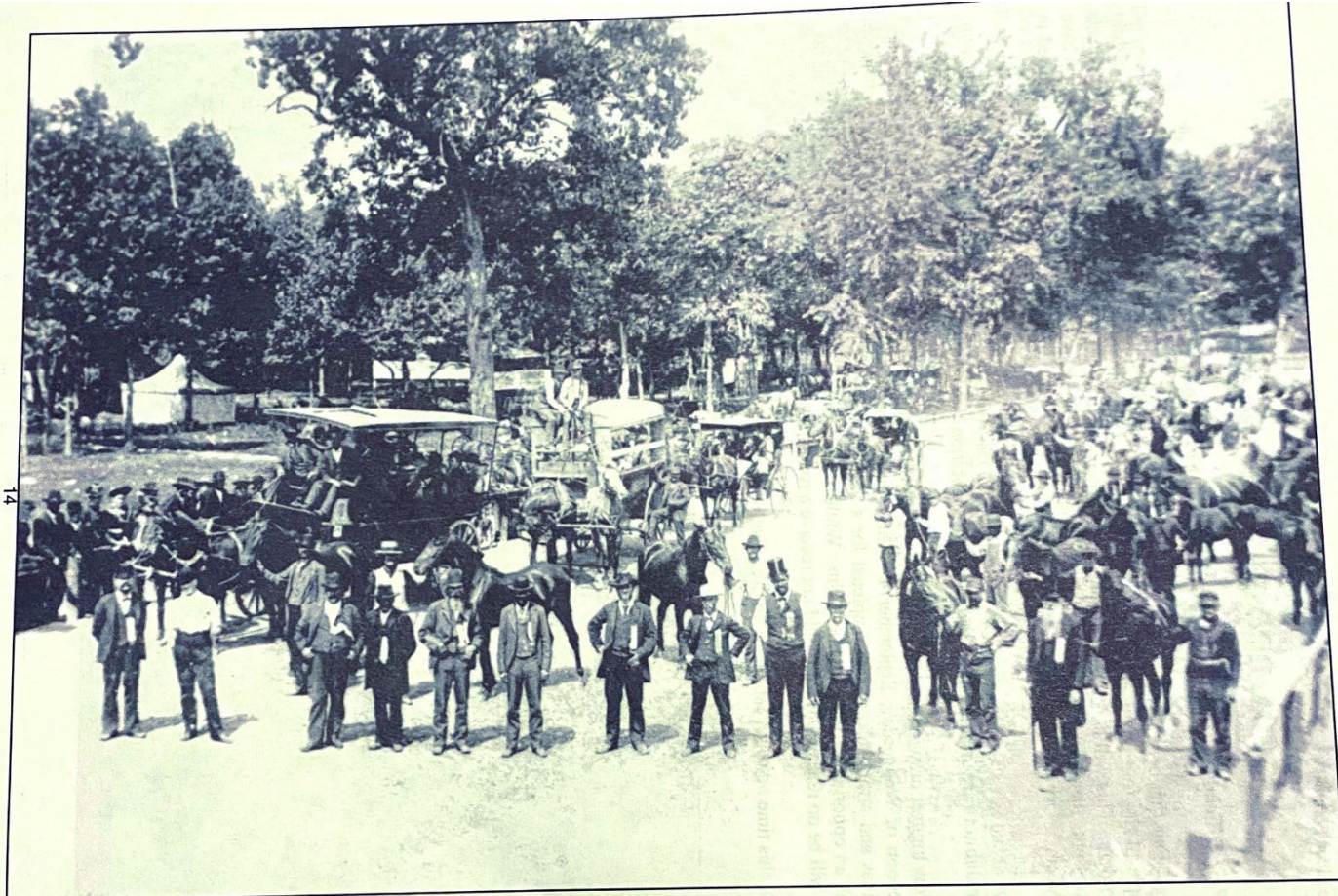
This is a scene from the early days of the Big-4 Fair. Judging from the attire, probably around the turn of the century.